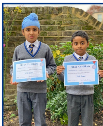
Year 4 Times Table Challenge - Silver