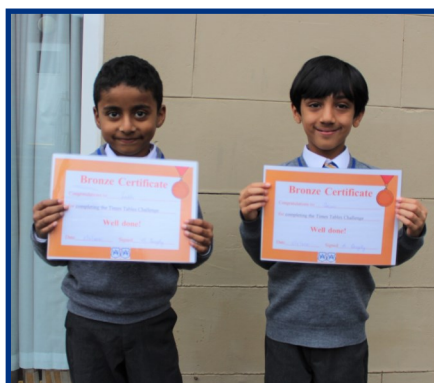
Year 4 Times Table Challenge - Bronze