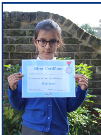
Year 4 Times Table Challenge - Silver