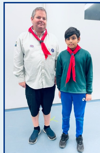
Investiture into Scouts

On your incredible achievements in and outside of school. We are incredibly proud of you all.